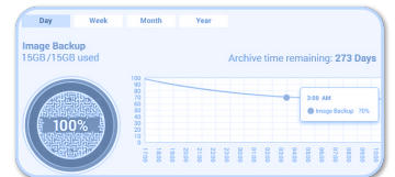
Fail Safe On-Board Backup Storage