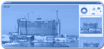
Live Video Preview

Specification includes camera system and managed services