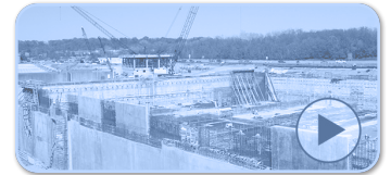
AI-Edited Time-Lapse Videos