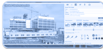
Take and Share On-demand Snapshots