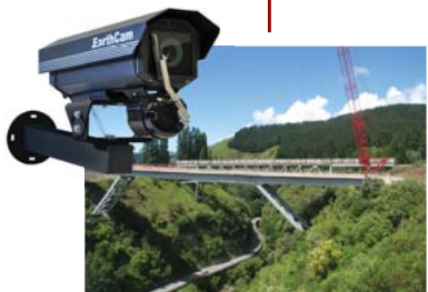
Matahorua Gorge, New Zealand

High-Definition Megapixel Documentation Cameras