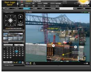
Live Video & Archiving