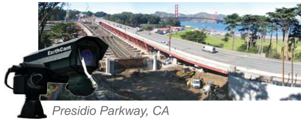
Presidio Parkway, CA

High-Definition Megapixel Documentation Cameras