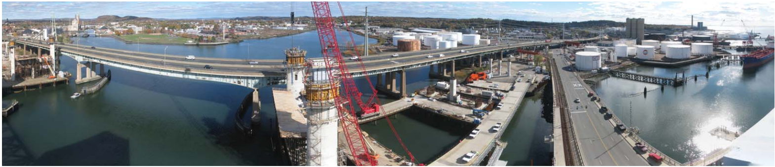
Pearl Harbor Memorial (Q) Bridge, New Haven, CT