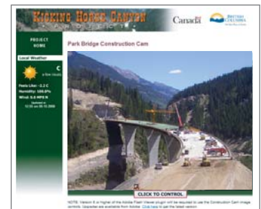
British Columbia, Kicking Horse

EarthCam is the recognized leader in providing webcam technology to government agencies since 1996. The company currently delivers hundreds of millions of images to more than 35 state DOT's, local municipalities and law enforcement agencies. EarthCam provides complete infrastructure services to install, manage and maintain live streaming video and superior megapixel camera systems.