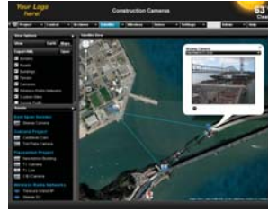
Google Map Navigation