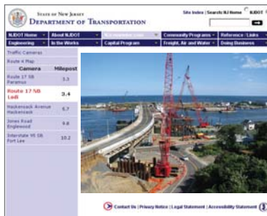
New Jersey DOT, Route 36