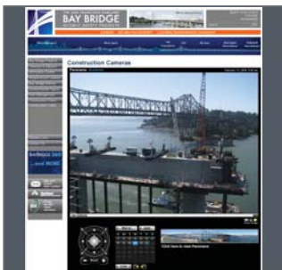
Caltrans, Bay Bridge