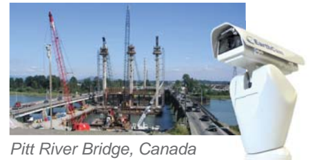
Pitt River Bridge, Canada

Live Streaming Video Project Management Cameras